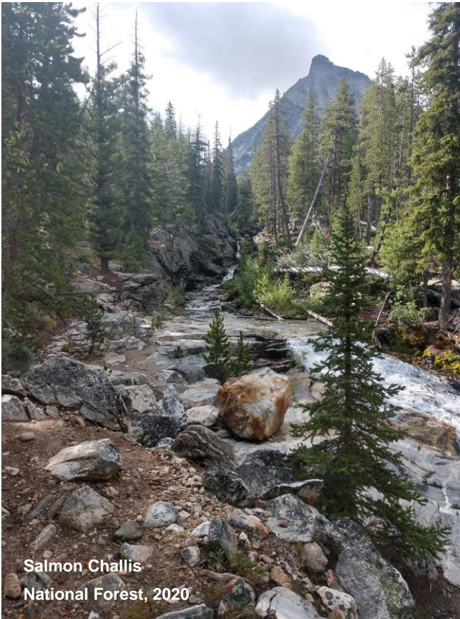
Salmon Challis National Forest, 2020

The Roadless Commission website is now hosted through OSC's webpage under the planning tab.