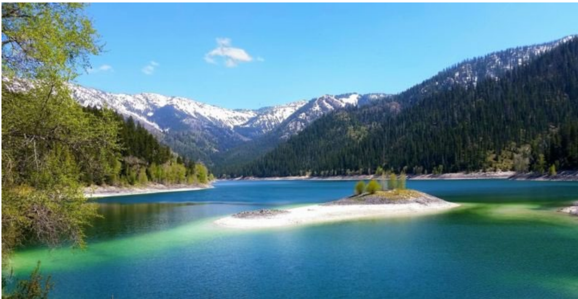
Upper Palisades Lake, Caribou Targhee National Forest