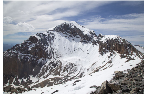
Photo: Diamond Peak, Salmon Challis National Forest

In order to better understand the background and meaning of the “substantially altered” language in the Rule and how it applies to Idaho’s roadless areas, the Commission had multiple meetings with officials from Region 1 and Region 4 and held a group discussion during the Spring 2021 meeting about further guidance from the Forest Service on that language. Ultimately, the Forest Service determined that further written guidance on the application of the ‘substantially altered’ language is not needed to administer the Idaho Roadless Rule.