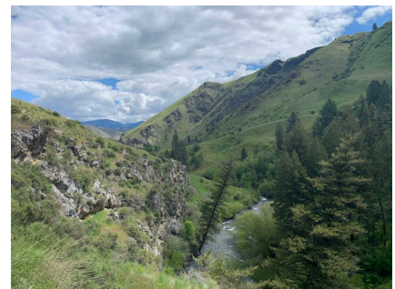
Photo: Rapid River Roadless Area, Payette National Forest