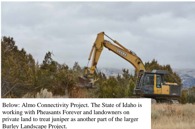
Below: Almo Connectivity Project. The State of Idaho is working with Pheasants Forever and landowners on private land to treat juniper as another part of the larger Burley Landscape Project.

The team works collaboratively to prioritize and fund actions in accordance with the Governor's Strategy. Priorities for funding include helping equip RFPAs to improve fire suppression capabilities, build strategic fuel breaks to slow the spread of wildfire, restore areas that have been degraded by wildfire from encroached juniper trees and annual grasses, restore and improve brood rearing habitat, and enhance the monitoring of sage grouse activity.