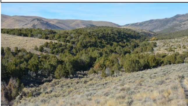
Before Juniper Treatment – Looking up Cottonwood Creek – Cassia County, Idaho